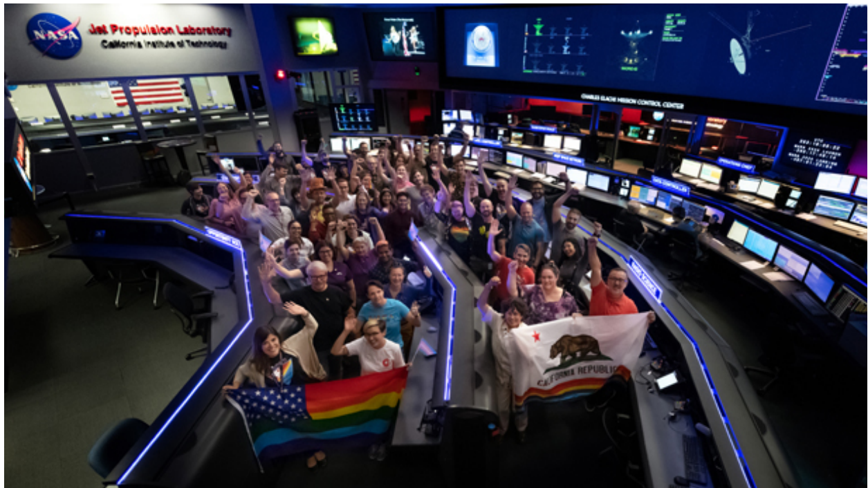
JPLers gather in Building 230 Mission Control during the 2019 National Coming Out Day on Oct. 11.

"I always loved science and space as a kid growing up, and working on these missions is a dream come true for me," he says. "I want to continue working on cutting-edge technology to improve our cyberdefenses and make sure our data and our folks are safe. Being part of that scheme is where I want to be."