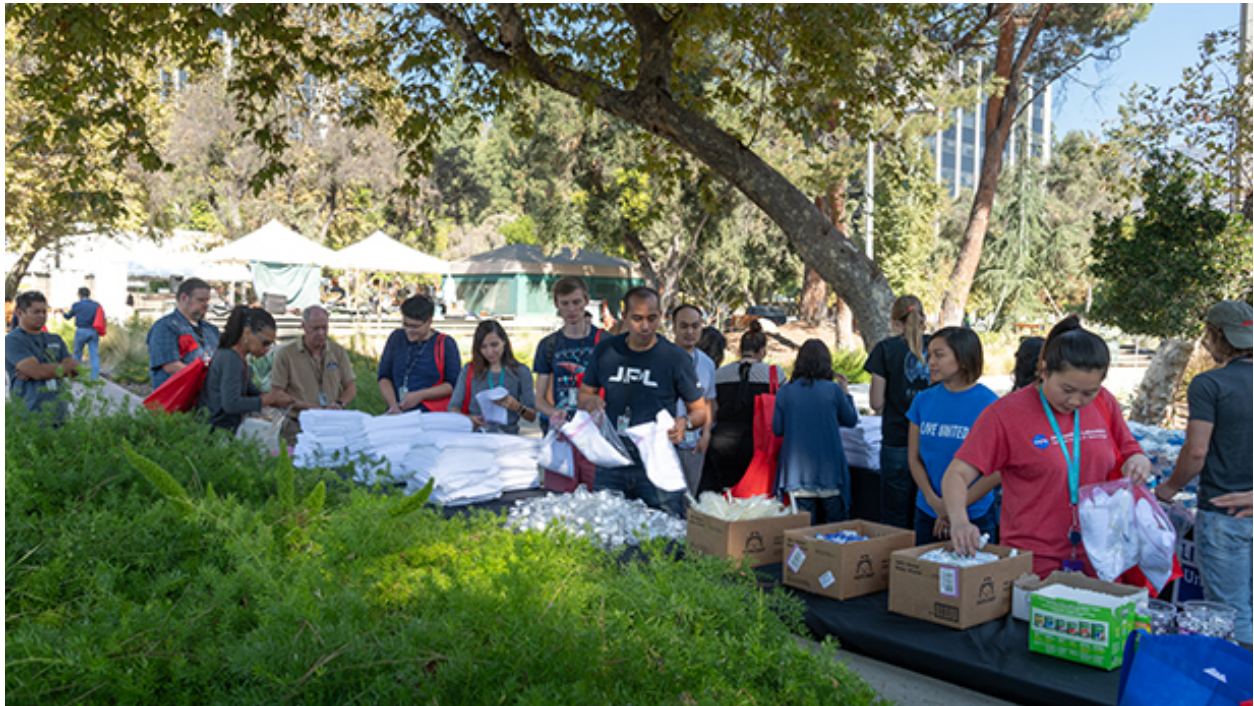
JPLers gather in Building 230 Mission Control during the 2019 National Coming Out Day on Oct. 11.