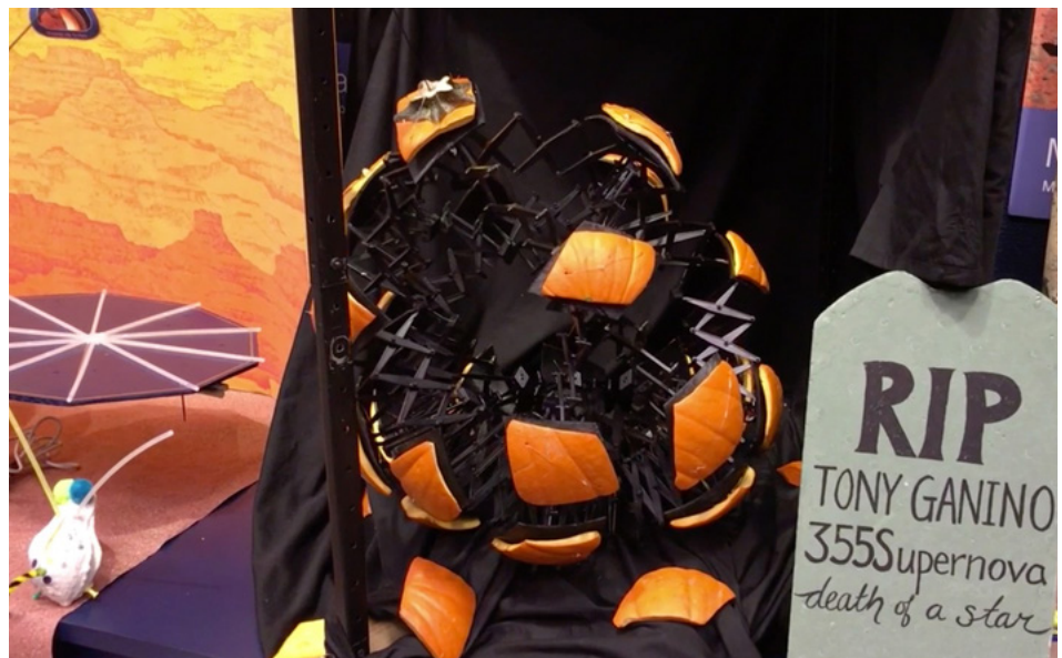
Super Nova Death of a Star took second place in Section 355's competition.