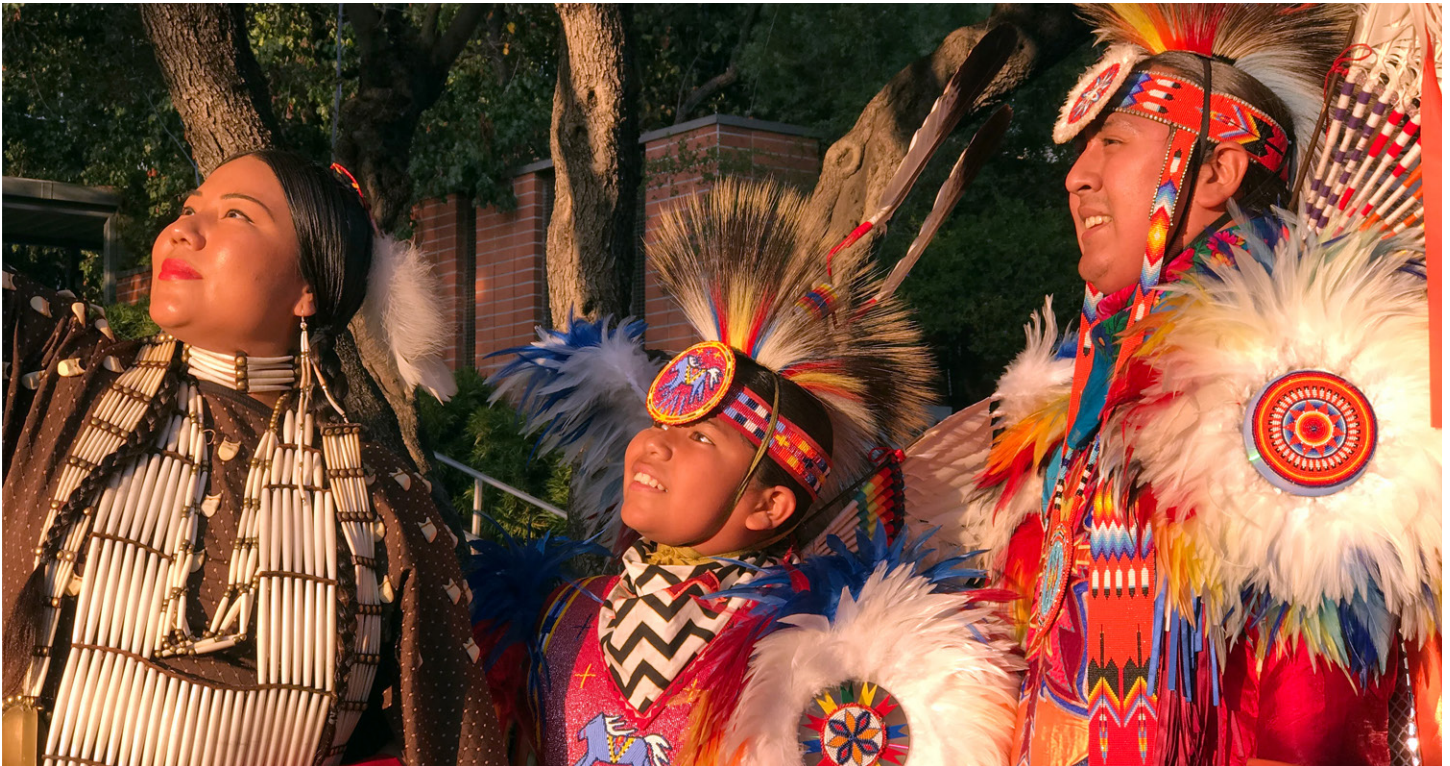
Foods from 17 countries and/or cultures highlighted JPL's 37th annual American Heritage event Oct. 12. Staff members were entertained by JPL's Shop 300 band, which played rock music between dances representing Irish, Chinese, Spanish, Egyptian, Native American, Indian, Polish and Armenian cultures.