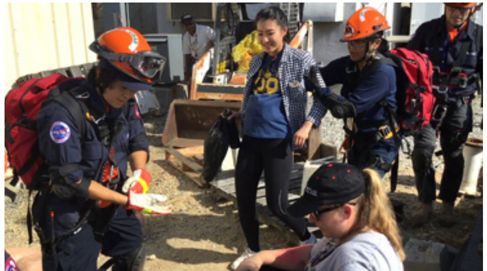
JPL's Urban Search and Rescue team prepares for quakes and other emergencies.

For both vehicle and home use, emergency planners suggest buying or making survival kits that stock items such as food, water, medicine, blankets, flashlights and portable radios. Some kits contain sturdy