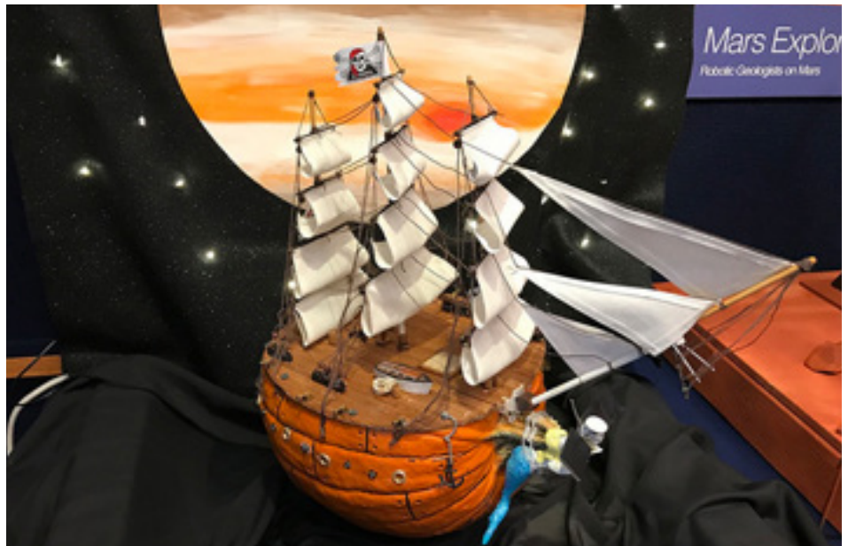
The Europa Clipper Pirate Ship pumpkin was awarded first place in the Section 352 competition.