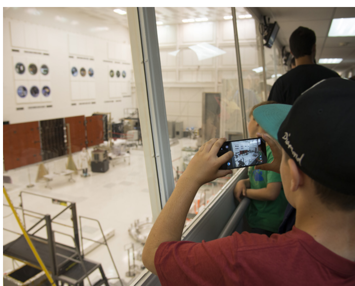
Clockwise, from top left: a young visitor sees the astronauts' point of view; a crowd is intrigued by RoboSimian, the JPL-developed ape-like robot; overlooking the clean room; an anxious group waits to enter the Space Flight Operations Facility.