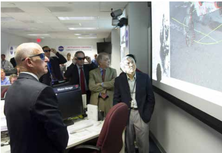
Dutch Steiger / JPL Photo Lab