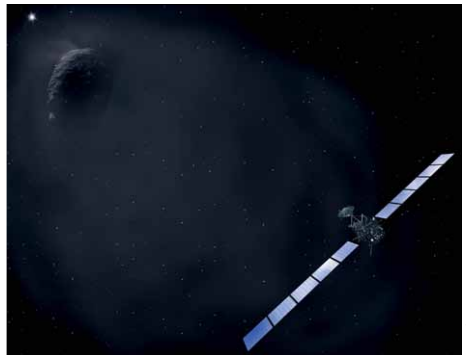
An artist's impression of Rosetta waking from deep-space hibernation to rendezvous with Comet 67P/Churyumov-Gerasimenko in 2014. The spacecraft will first fly by asteroid Lutetia in July.

ing Group) work on telemetry, analysis software and data processing, as well as the science.