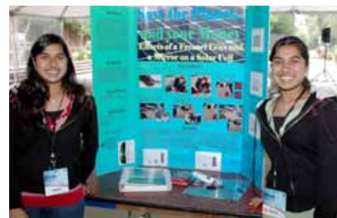
Students display their project at the science fair.