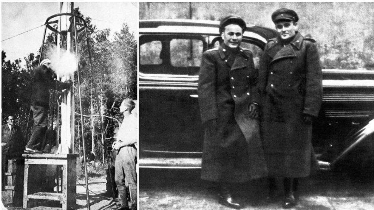
Georgiy Tyulin (left) and Sergey Korolev, 1946, during the Soviet effort to recover German missile technology.