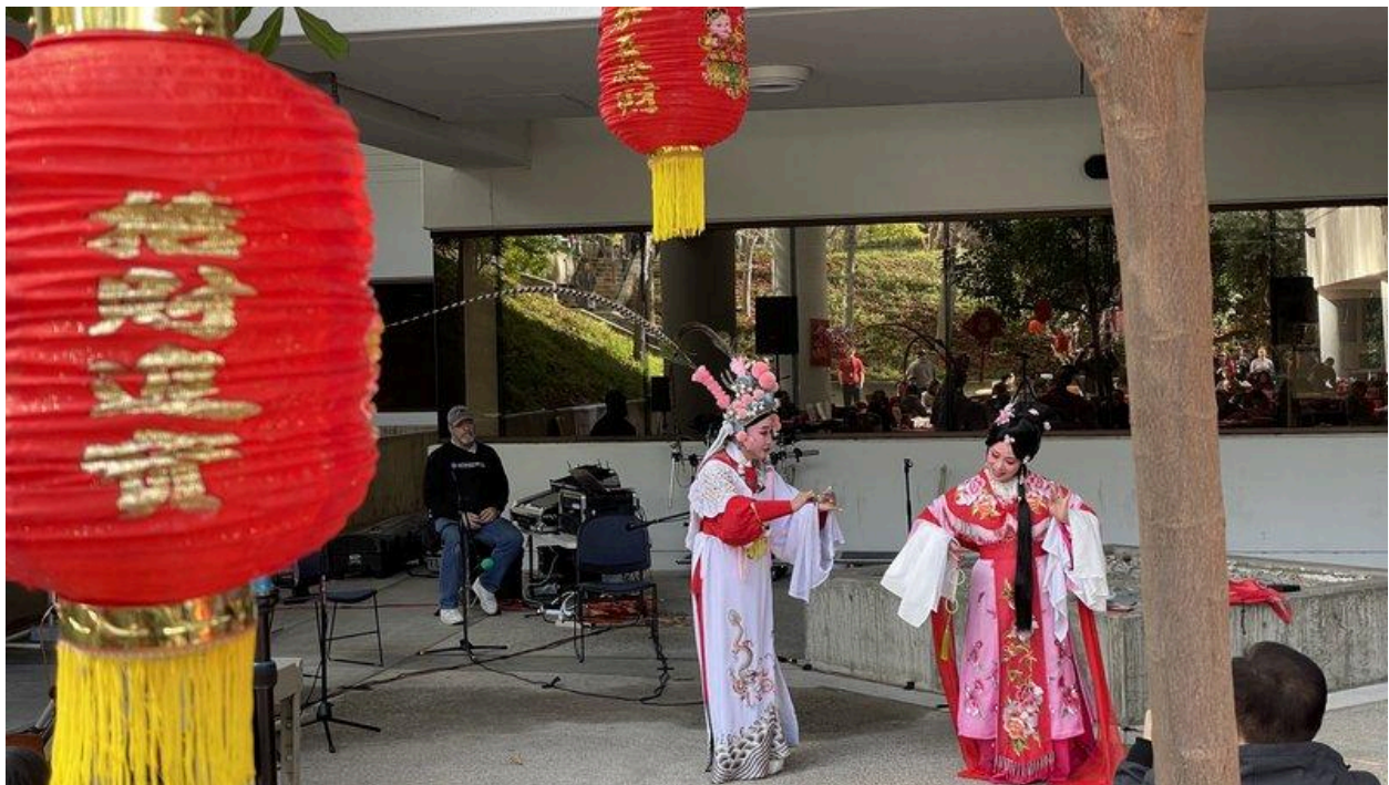
Members of the Yue Opera Troupe perform during the Lunar New Year celebration on Feb. 8 on Building 301's patio.