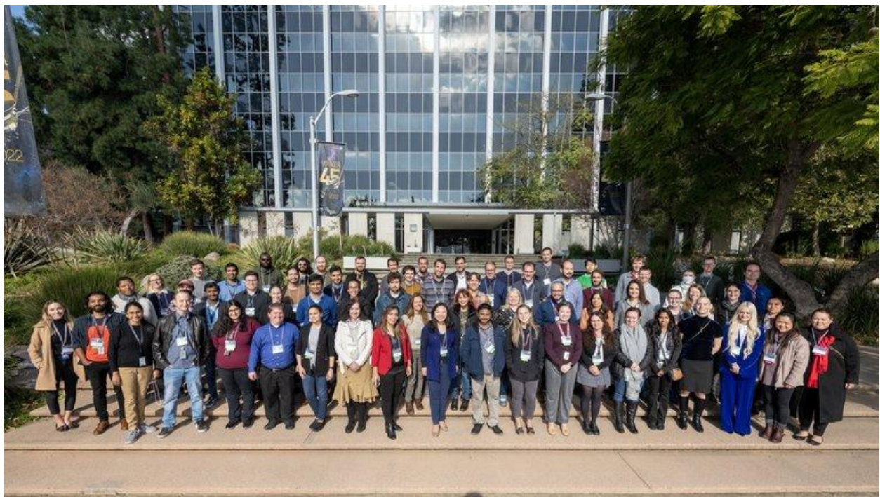
JPL Postdoctoral Fellows contributed 75 posters to this year's Research Poster Conference & Postdoc Research Day.

Simons followed with a call to remember the vital role collaborative events have on bringing the Lab’s research efforts from the poster board to real-world applications.