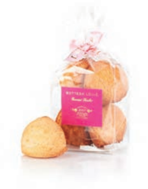
COCONUT ROCHER Chewy & creamy coconut made in small batches with the finest ingredients.

Traditional butter cookies made with Madagascar vanilla bean & enrobed in 70% dark chocolate.