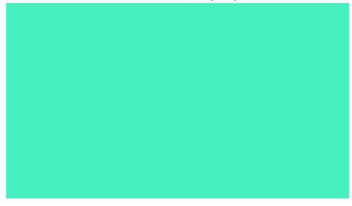
Time 0 is initiation of paclitaxel or Herceptin + paclitaxel therapy.